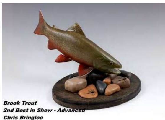
Brook Trout 2nd Best in Show - Advanced Chris Bringleo

Example images from their Website https://nbcarving.ca/