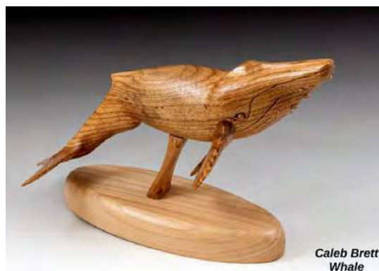
Caleb Brett Whale